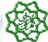
Municipality of Teheran